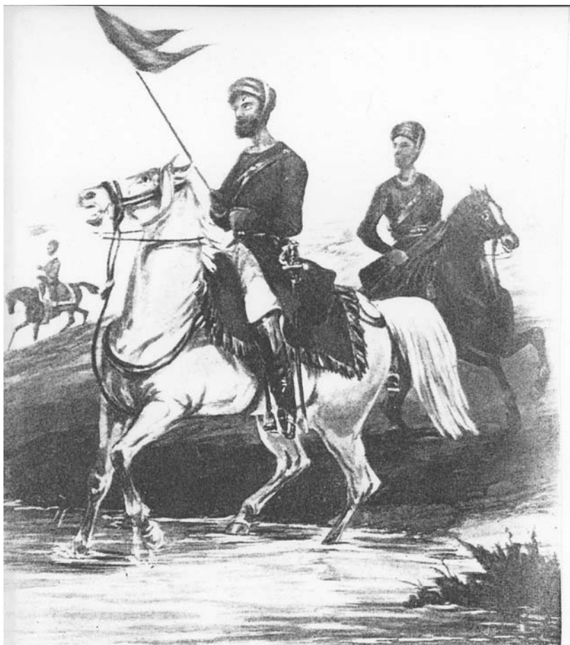
Figure 2 Cavalymen of the Hyderabad Contingent, 1845.

Indian and British soldiers, exposed as they were to the same set of dangers. Just as white men went Doolally in India, so stories of Indian soldiers falling into states of ecstasy and distraction were by no means uncommon. Presumably they were part of a larger pattern of soldiers turning into 'ecstatics' ( majzûbs ) who represented the human fall-out of the harshness of barracks life and the experience of battle. 46 The traumatised soldier was not merely the detritus of war but had been common enough to be a specific social type in India, recognisable to his fellow warriors and serving a useful social purpose. But as India's military culture was